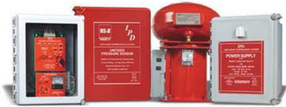
An Explosion Suppression System from BS&B From left, System Monitor, Triplex Explosion Pressure Sensor, Suppression Cannon™ and Power Supply.

BS&B Safety Systems, LLC. & IPD manufacture industrial protection technology to meet the requirements of NFPA 654, as well as NFPA documents 68 & 69. Please contact us if your needs include, Material Hazard Analysis, Deflagration Venting, Deflagration Isolation, Deflagration Suppression, or Process Hazard Analysis.