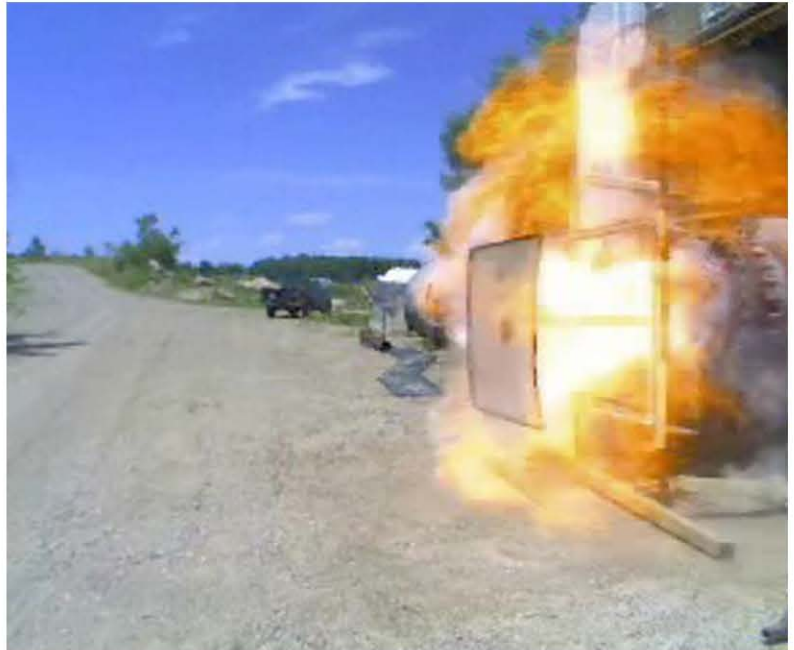
Activation of Explosion Vent by Corn Starch deflagration in 100 cubic meter test vessel

To assist in the understanding of these new requirements, we have compiled this review of frequently asked questions: